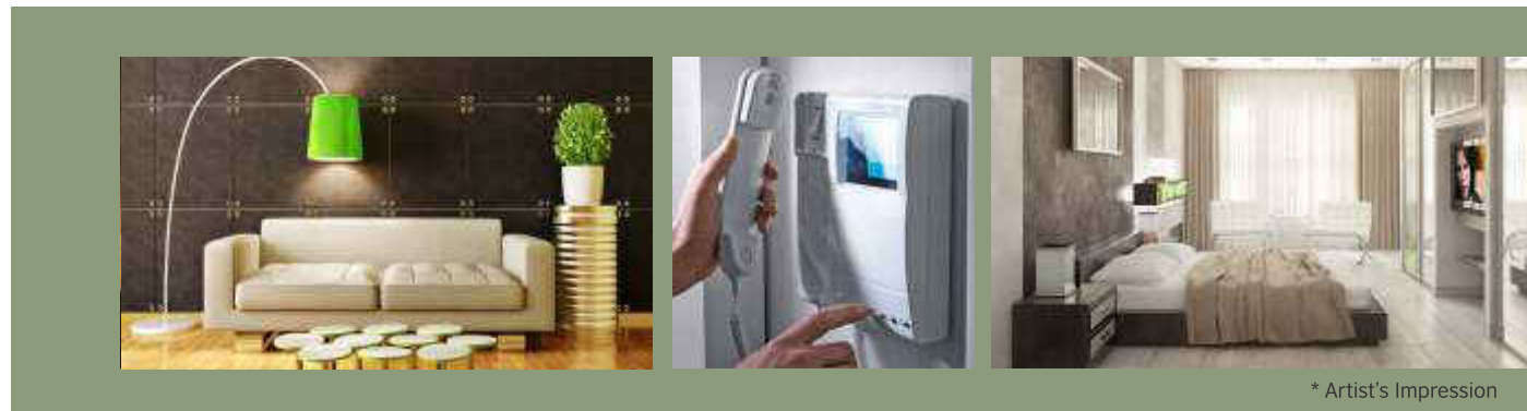
* Artist's Impression