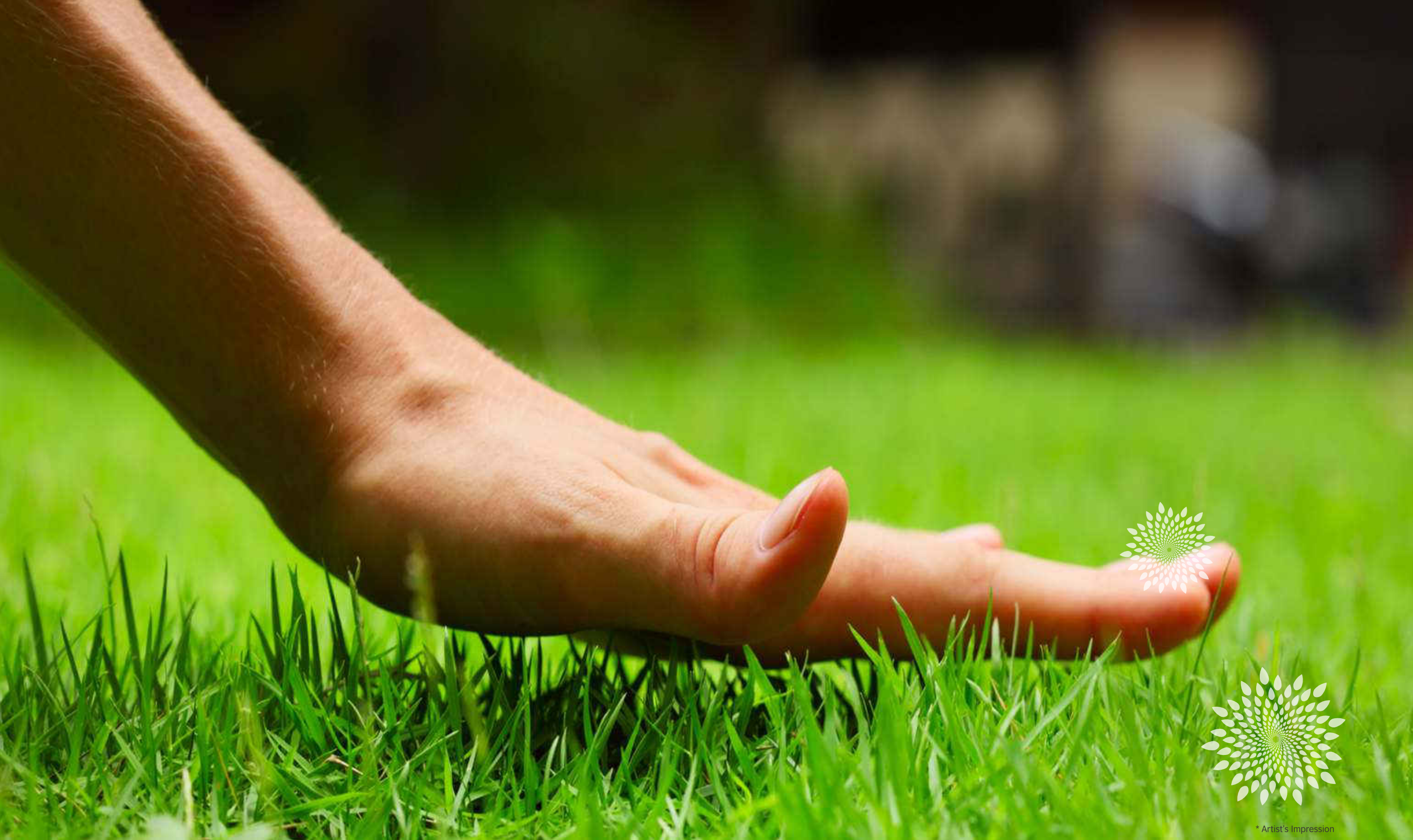
* Artist's Impression