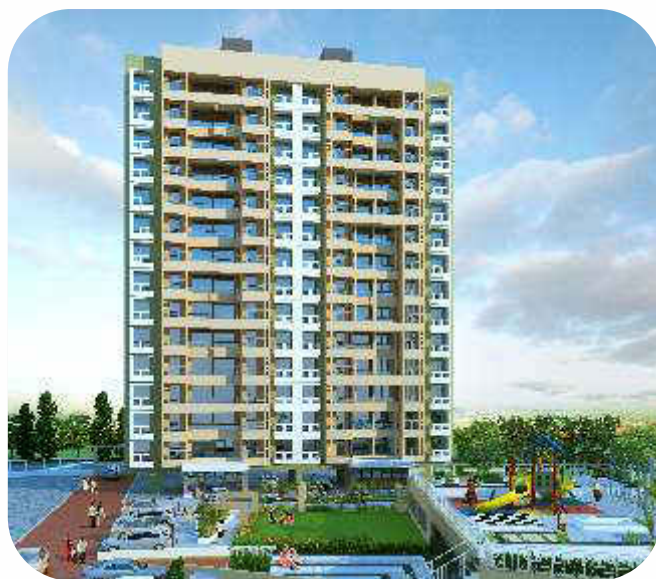
TULIP at Kanungo's Garden City