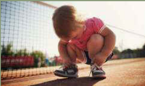
* Artist's Impression